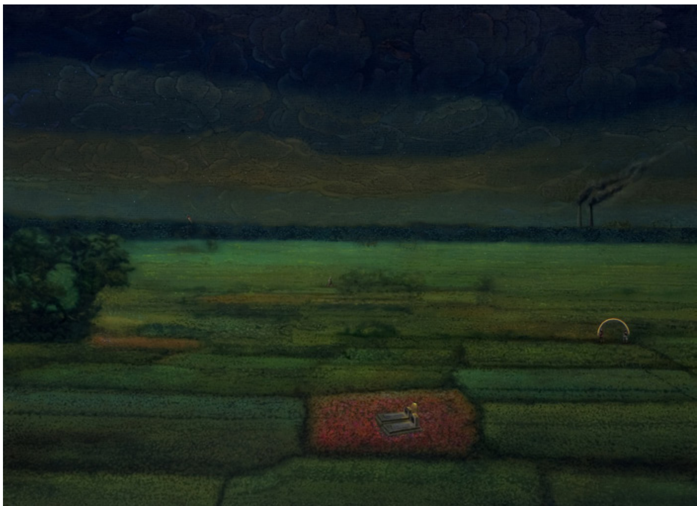
"Silent as grave" 84x60 inches