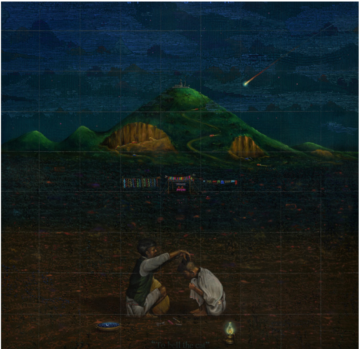
" He who eat fire craps fire" 54x54 inches