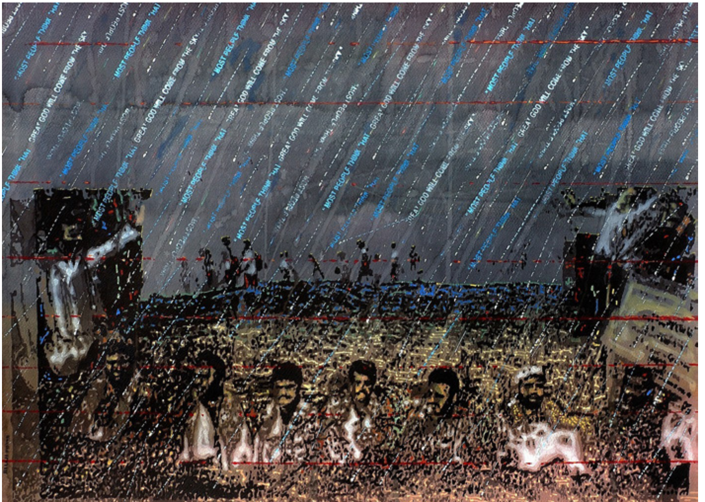
"First rain" 21x29 inches