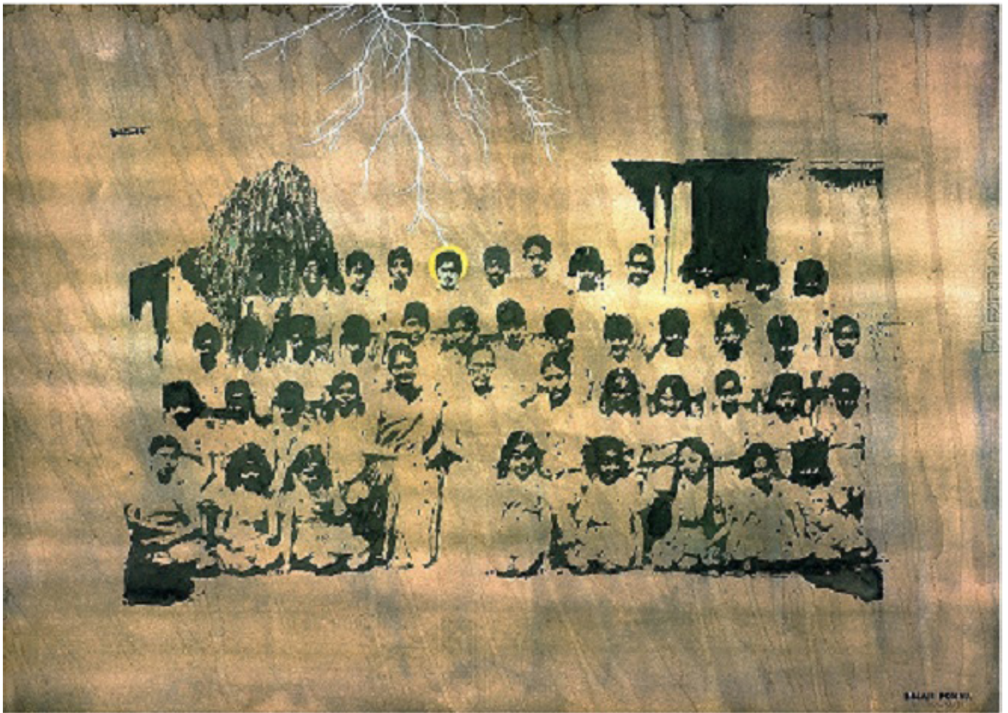
"Enlightment" 18.5x26.5 inches